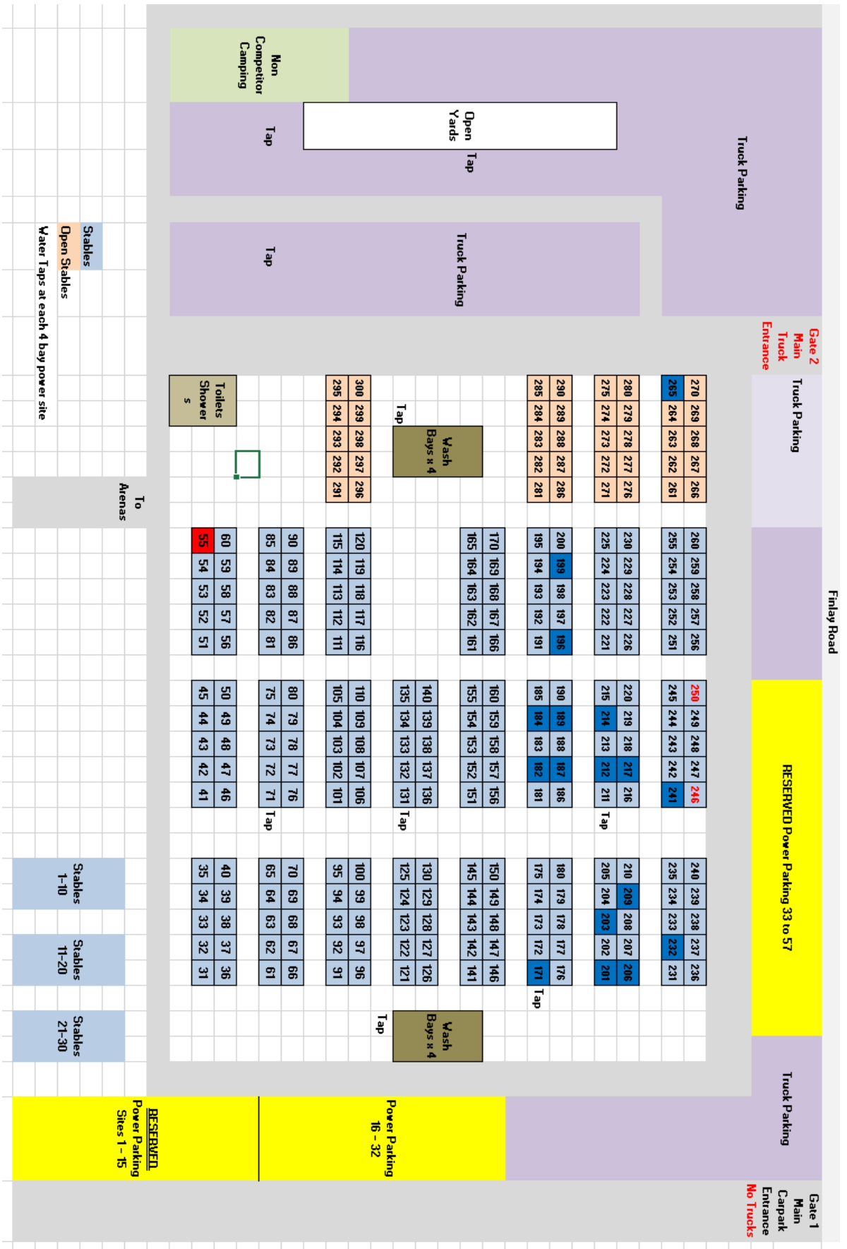
Stabling area map