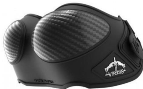
Heel protector without pastern wrap