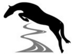
Brookby Horse Trial