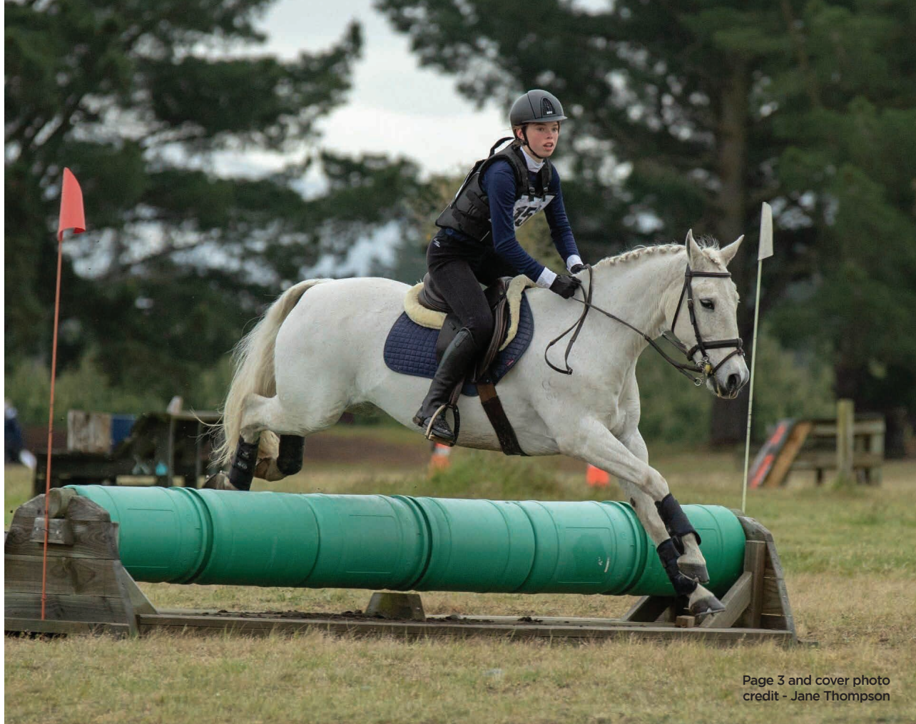
Page 3 and cover photo credit - Jane Thompson