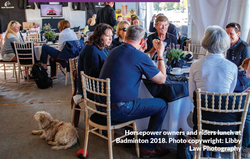
Horsepower owners and riders lunch at Badminton 2018.