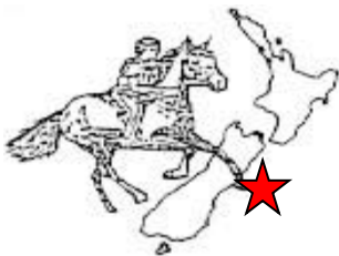
Canterbury Endurance and Trail Riding Club Inc.