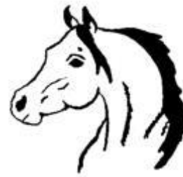
Kohuratahi Endurance Riding Club