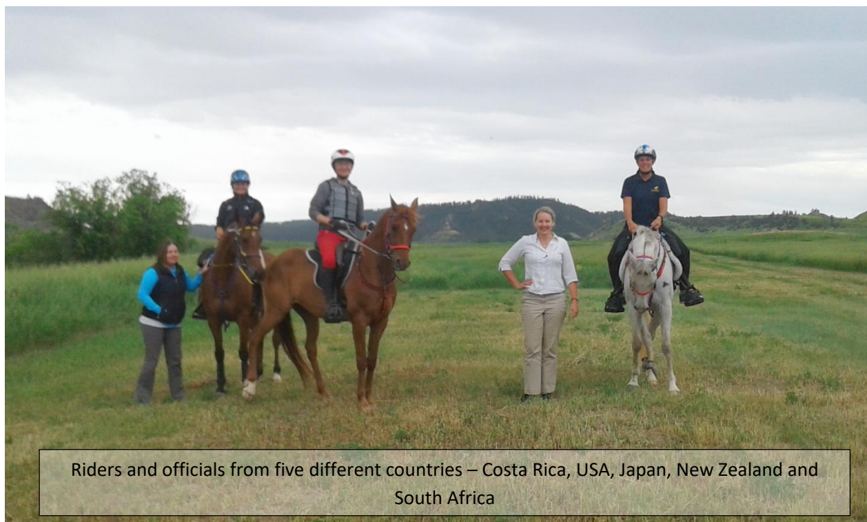
Riders and officials from five different countries – Costa Rica, USA, Japan, New Zealand and South Africa