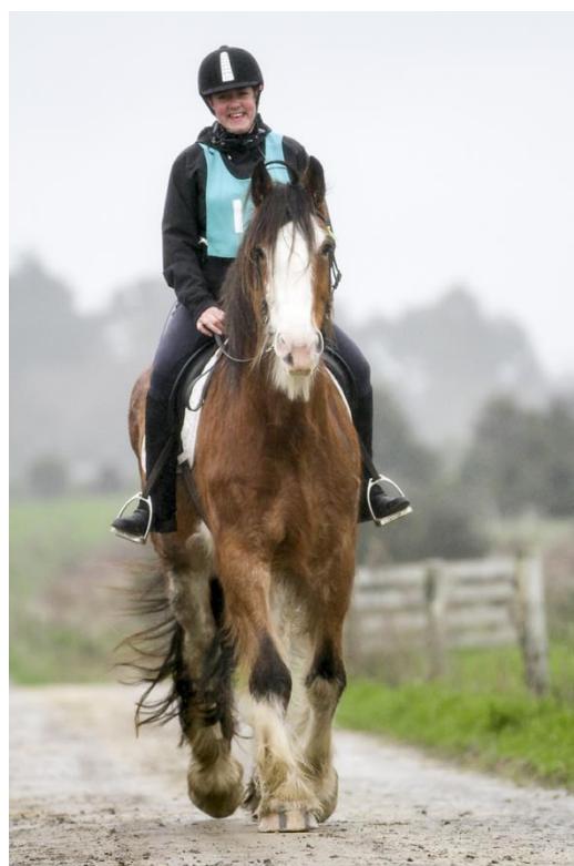
A happy pair in the novice 10km class