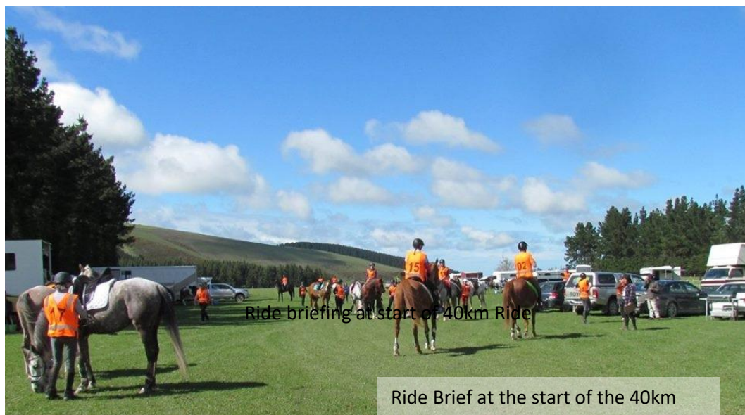
Ride briefing at start of 40km Ride

Danielle Green. Also to all the helpers who chipped in over the weekend especially with setting up the vet gate & cleaning up afterwards. It proved that many hands make light work!