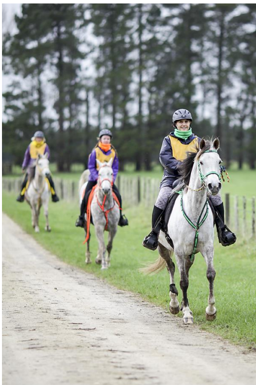
A trifecta of colour co-ordinated Tararua Arabians riders in the 34km classes