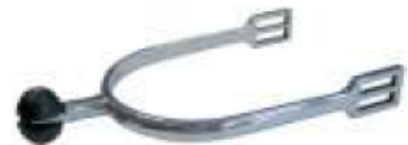
Diagram 3 Impuls Spur