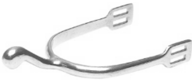
Diagram 1 Gooseneck Spur