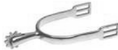
Diagram 2 Blunt or Smooth Rowel Spur