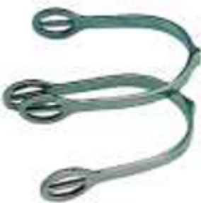
Diagram 4 Dummy Spurs